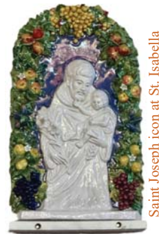
Saint Joseph icon at St. Isabella

The scandal of family life today is 25% of fathers are not involved in family life. They are absent. That is 1 in 4 children never see their father. A culture of renegeing of sacred responsibilities. Saint Joseph never speaks a word in all of Scripture. But his presence is deeply felt in his family. He is profoundly involved in all their lives, Mary and Jesus, and faces all the challenges that strike his family. He does not run away. He faces challenges, confusion and situations not under his control. Yet he does not strike out in anger or self pity. He is faithful to his commitments. He works, protects and provides. He is a loving father. Saint Joseph is a model of fatherhood.