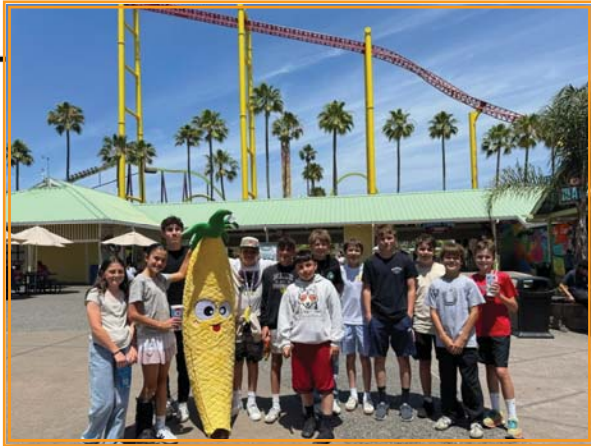
Altar Servers trip to Six Flags Amusement Park