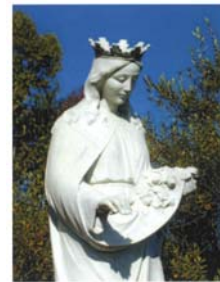
Saint Isabella, Feast Day July 4th.