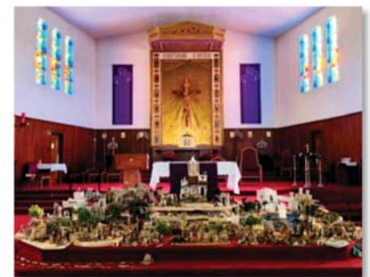
Christmas crib at St. Isabella