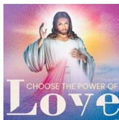
Month of June, dedicated to the Sacred Heart of Jesus

Thousands participate in launch of National Eucharistic Pilgrimage . https://sfarch.org/eucharistic-revival/#PILGRIMAGE . Also check out EWTN coverage.