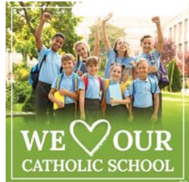
Celebrate Catholic Schools Week

Thank you for your generous gifts May God reward your generosity!