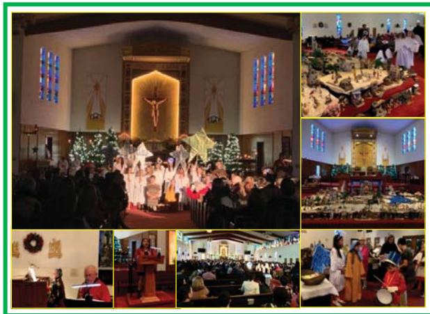
Christmas Eve Mass Nativity Pageant presented by St. Isabella School & PSR

The second collection this weekend is for our St. Vincent de Paul Conference . Housing costs and rents are increasing in our area. This is especially hard for our neighbors who are living on the edge, can barely afford food and utilities, and are at risk of becoming homeless. St. Vincent de Paul provides assistance with rent, food and utilities to families in our neighborhood. Please help us help your neighbors in need.