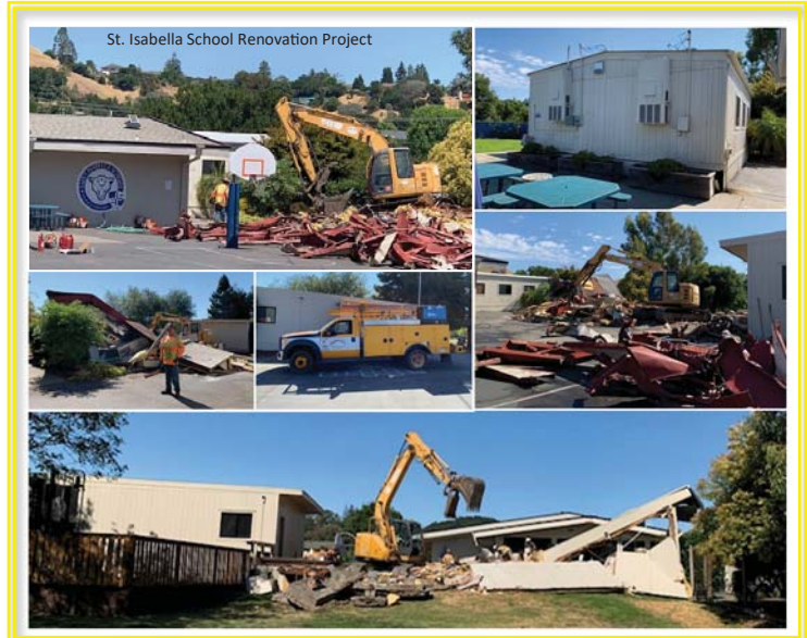
St. Isabella School Renovation Project

Please keep in your prayers those who lost their lives in the Maui wildfire and keep the community of Lahaina also in our prayers.