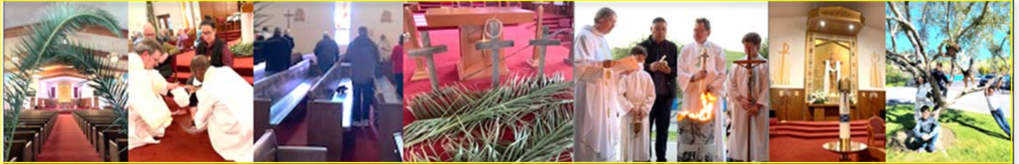
Holy Week & Easter at St. Isabella