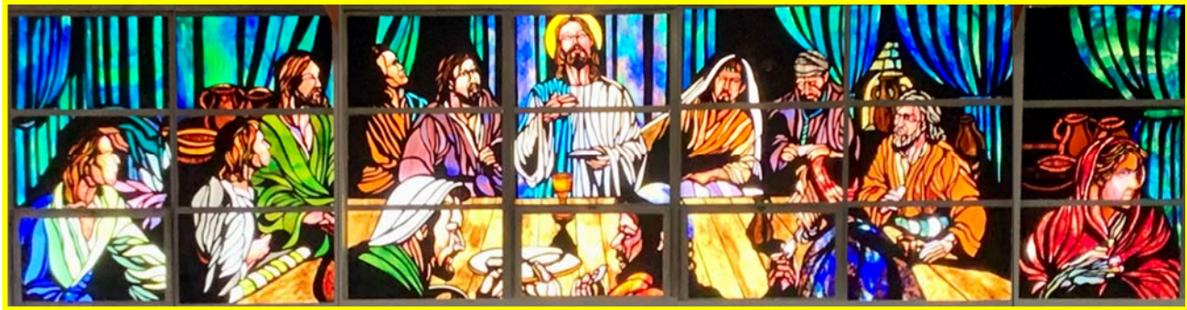
"The Last Supper" - Stained glass windows at St. Isabella

Matthew shows all of these events fulfill the prophecies of the Old Testament that the Lamb must first suffer, and die, and be raised.