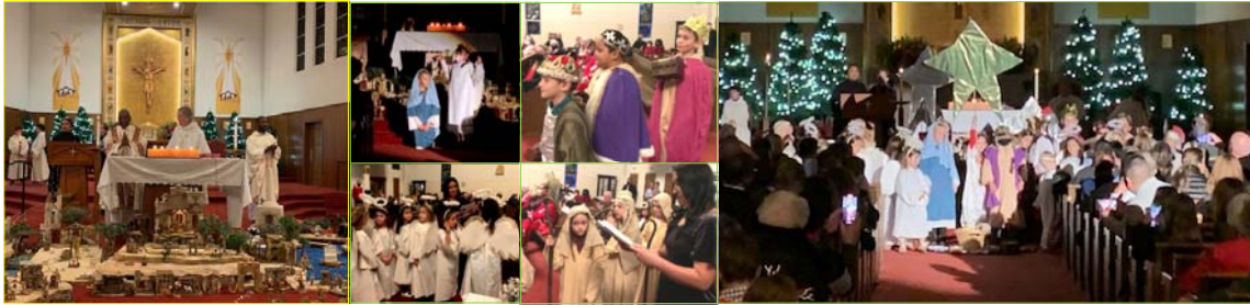
Christmas Pageant performed by St. Isabella School

The magi search for something bigger than themselves. They seek eternal wisdoms. They are prepared to give time out of their lives in this quest for the hunger of their souls. Once finding it, they no longer search for idolatrous gods.