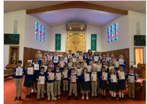
All Saints Day Mass—Students with their Saints

I am amazed when I hear some priests do not want to speak out against abortion on Sundays because it might offend some people. My goodness this is Catholic property. If we cannot speak our truths on Catholic grounds, then we don’t believe in them (that simple).