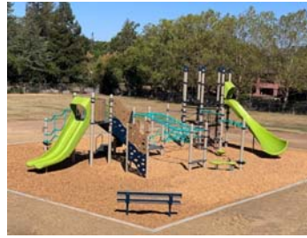
New playground at St. Isabella