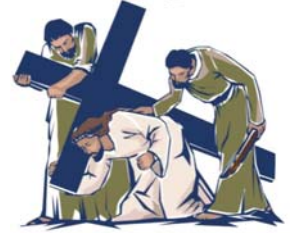
HOLY WEEK SCHEDULE