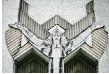
Christ the King Church Cork, Ireland

A king in the ancient world was the highest authority of the land. He made the laws and all owed allegiance to him. Therefore, the question put to Jesus, “Are you a King” is one of life or death. No king will stand for an adversary to his throne.