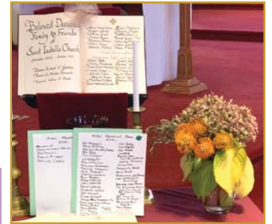
November, Month of All Souls. Fond memories and prayers for all we miss dearly.