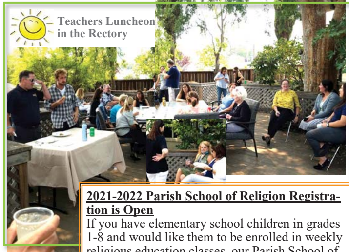
Teachers Luncheon in the Rectory

Housing costs and rents are increasing in our area. This is especially hard for our neighbors who are living on the edge, can barely afford food and utilities and are at risk of becoming homeless. St. Vincent de Paul provides assistance with rent, food and utilities to families in our neighborhood. Please help us help your neighbors in need.