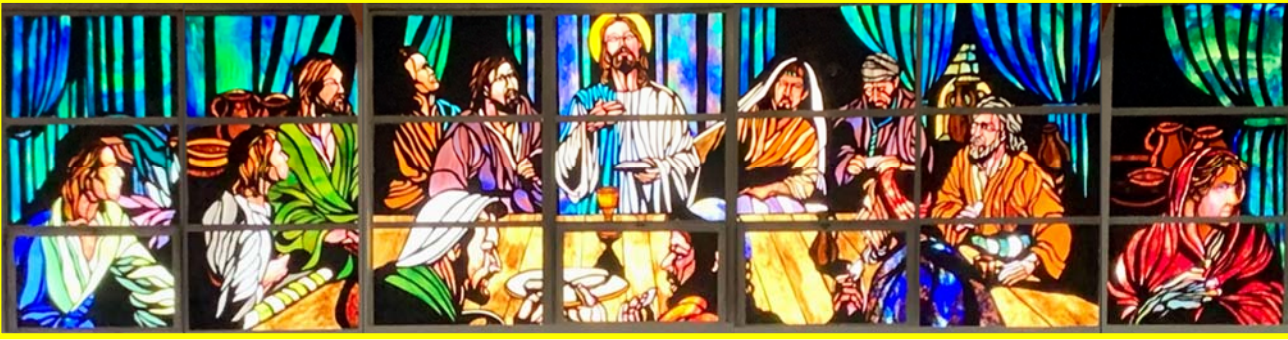
"The Last Supper" - Stained glass windows at St. Isabella

Matthew shows all of these events fulfill the prophecies of the Old Testament that the Lamb must first suffer, and die, and be raised.